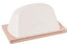
Longlife 54 Shore-00 44 Shore-00

The OrbiX pad range includes the following pad types: