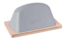
StarX 64 Shore-00 54 Shore-00 44 Shore-00 39 Shore-00