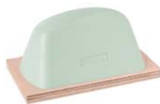
Green 44 Shore-00