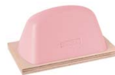
Red 54 Shore-00