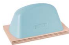
Blue 64 Shore-00